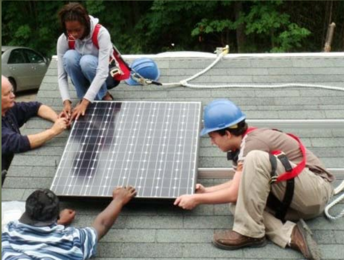
Milwaukee Solar MCSC