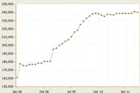
BadgerCare Plus Enrollment in Metro Milwaukee