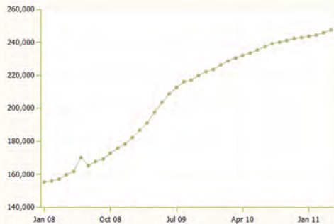
Food Stamp Enrollment in Metro Milwaukee