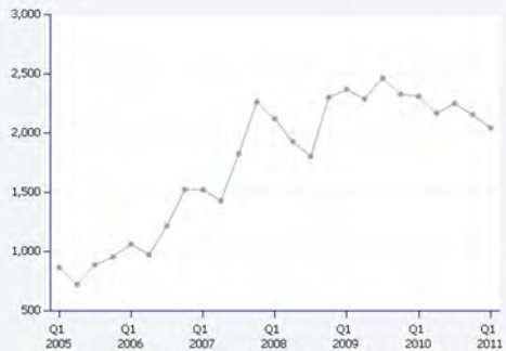
Home Foreclosures in Greater Milwaukee