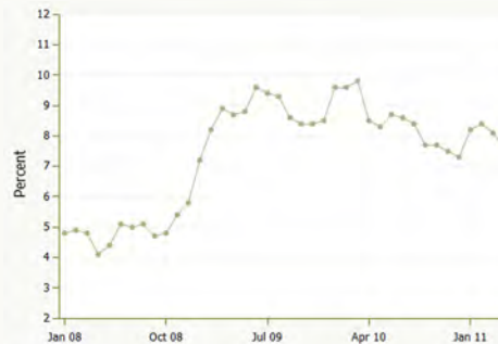
Metro Milwaukee Unemployment Rate