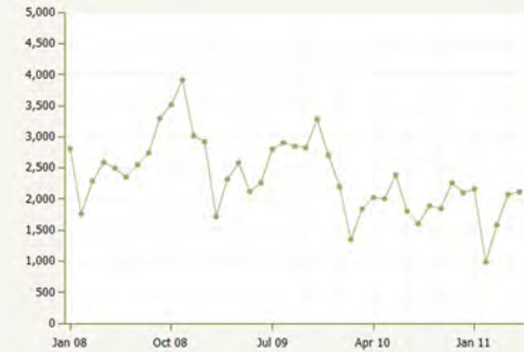
Calls for Food Assistance